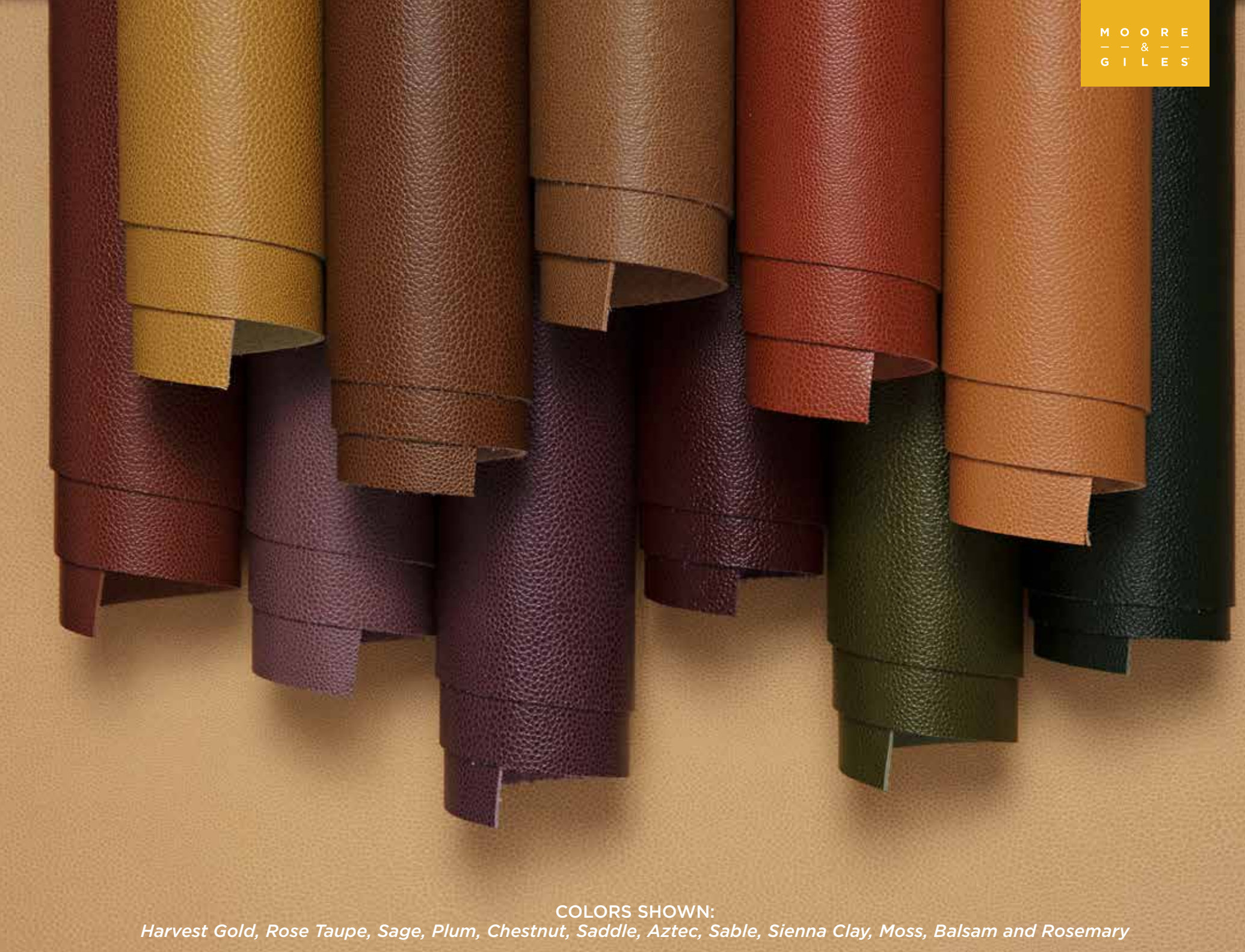
COLORS SHOWN: Harvest Gold, Rose Taupe, Sage, Plum, Chestnut, Saddle, Aztec, Sable, Sienna Clay, Moss, Balsam and Rosemary

AN ARRAY OF WARM AND WELCOMING SHADES INSPIRED BY THE ELEMENTS THAT EXUDE LAID BACK LUXURY AND NATURAL APPEAL.