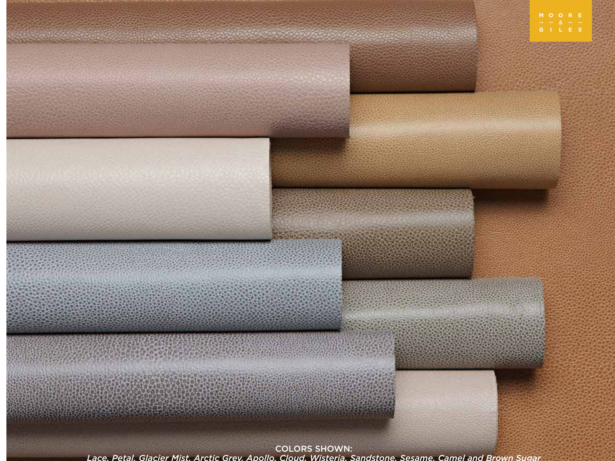
COLORS SHOWN: Lace, Petal, Glacier Mist, Arctic Grey, Apollo, Cloud, Wisteria, Sandstone, Sesame, Camel and Brown Sugar

AN ASSORTMENT OF SOOTHING, SOFTLY MUTED SHADES DESIGNED TO IMPART INTERIORS WITH GRACEFUL GLAMOR AND STYLISH SIMPLICITY.