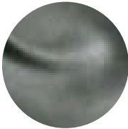
Slate Grey Enchanted Silver