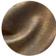
Granite 24K Gold