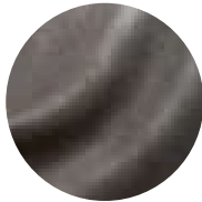
Granite Enchanted Silver