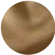
Camel Gold Patina