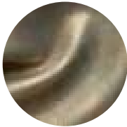
Slate Grey 24K Gold