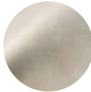
Ivory 24K Gold