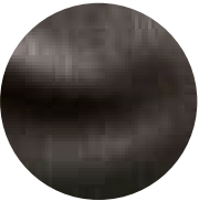
Stormy Navy Metallic Stripes