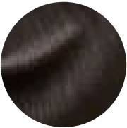
Smoke Navy Metallic Stripes