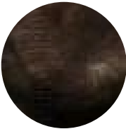
Black Multi Bronze