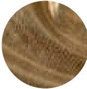
Taupe Copper Bronze