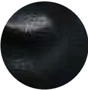
Blue Moon Glaze