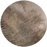
Cream Multi Pewter