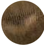
Buttercup Multi Bronze