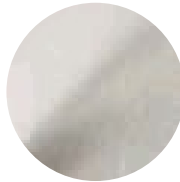
Cream Silver Matte