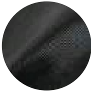
Black Black Pearl