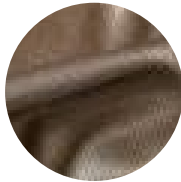
Blue Moon Rose Gold