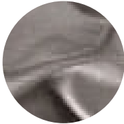
Stormy Silver Matte