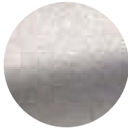
Stormy Hammered Silver