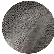
Super White Black