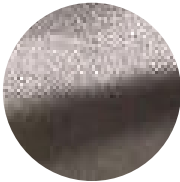
Smoke Taupe Pearl