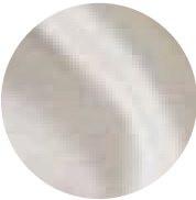
Cream Taupe Pearl