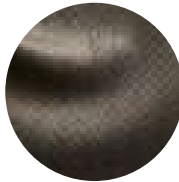
Stormy Copper Pearl