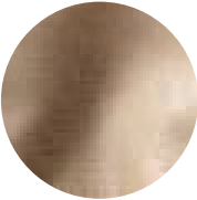
Taupe Taupe Pearl