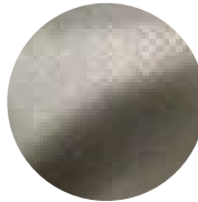
Stormy Radiant Silver