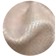
Stormy Taupe Pearl