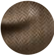
Smoke Taupe Pearl