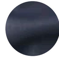
In The Navy