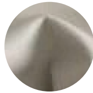
Cliffs of Dover