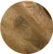
Natural Copper Bronze