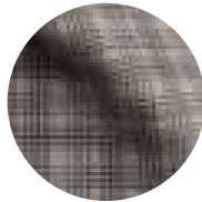
Super White Brown Dust Matte