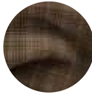
Stormy Taupe Pearl