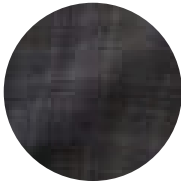
Adriatic Brown Dust Matte