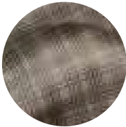
Cream Brown Dust Matte