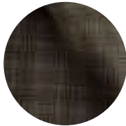
Stormy Brown Dust Matte