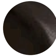
Espresso Black Pearl