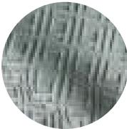
Cottswald Slate Grey