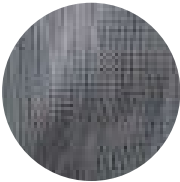
White Blue Metallic