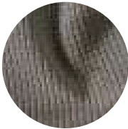
Satin Suede Smoke