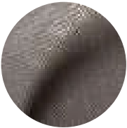
Smoke Hammered Silver