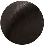
Espresso Black Pearl