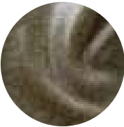
Taupe Black Pearl