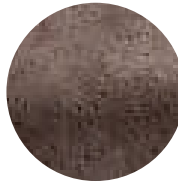
Satin Suede Smoke