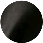
Black Super Black Matte