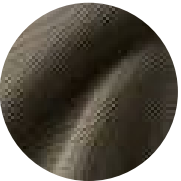
Stormy Super Black Matte