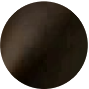
Espresso Super Black Matte