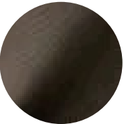
Smoke Super Black Matte