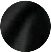
Blue Moon Super Black Matte