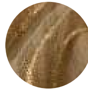
Natural Copper Bronze