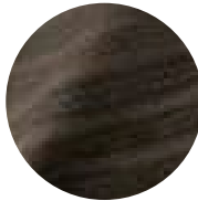
Smoke Black Matte