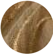
Natural Copper Bronze