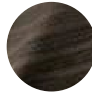
Smoke Black Matte