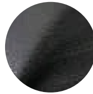
Iron Black Pearl