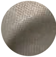
Taupe Hammered Silver