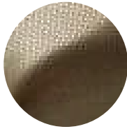
Taupe Antique Gold