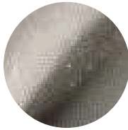
Stormy Hammered Silver