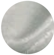
Sky Blue Hammered Silver