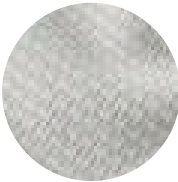
Satin Suede Cream