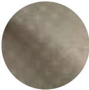
Cream Gold Matte