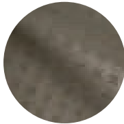
Stormy Platinum Matte