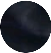
Black and Blue